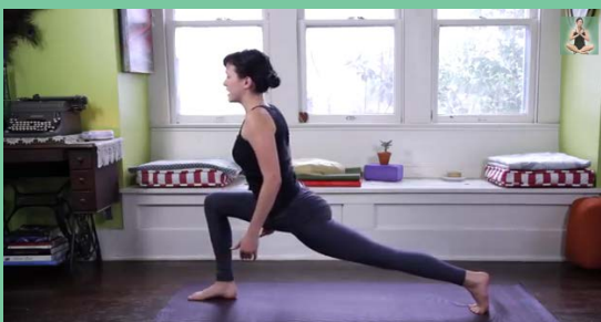
YouTube search terms: Yoga for Weight Loss