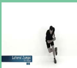
YouTube search terms: fitness blender sports