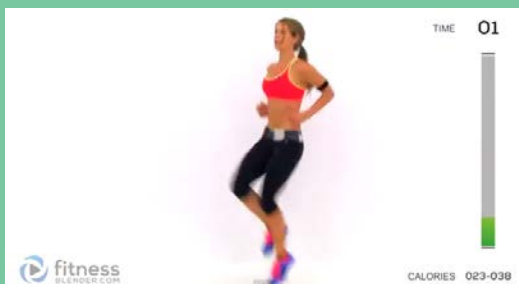
YouTube search terms: Bodyweight Cardio Workout