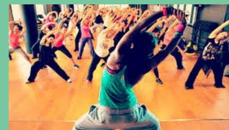
YouTube search terms: Zumba Workout Compilation