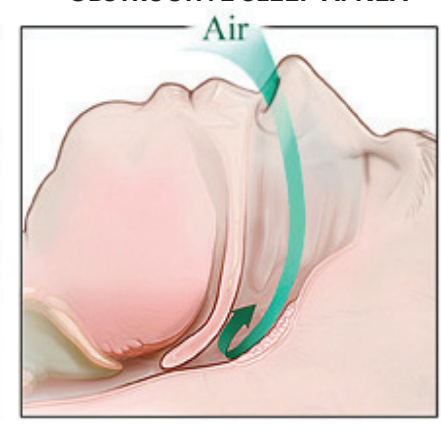
AIRWAY IS BLOCKED AND AIR DOES NOT MOVE THROUGH