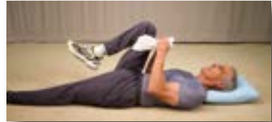
single knee to chest with towel