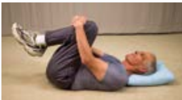
double knee to chest without towel