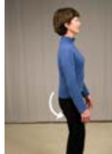
standing with pelvic tilt