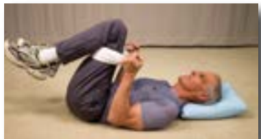
double knee to chest with towel