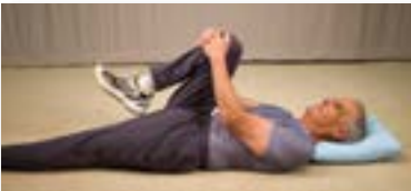
single knee to chest without towel

Lie on your back. With both hands or with a towel or strap, pull 1 or both knees toward your chest. Hold for 30 to 60 seconds, repeat 2 times. Tighten your stomach muscles and then slowly let your leg(s) back down one at a time.