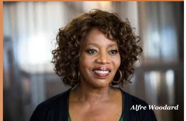
Actress Alfre Woodard will receive the Pan African Film Festival Lifetime Achievement Award.

For a complete list of screenings, special screenings, panel discussions and an events lineup visit www.paff.org .